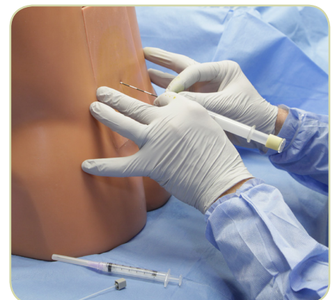
Self-sealing, Durable Tissue