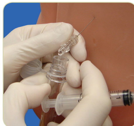
Spinal Fluid Can Be Collected